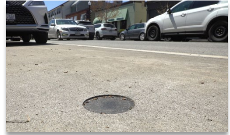
SPS-X sub-surface sensor when installed

1,200 wireless SPS-X™ sensors were installed in thirty-two lots and additional on-street spaces throughout the paid parking area in the Town of Oakville's busy downtown core. Once enough data had been collected to quantifiably determine which streets were busiest and which often had available parking, eleven-x worked with the Town of Oakville to develop a parking guidance system that would drive congestion caused by drivers cruising for parking away from busy streets and toward streets with less congestion – and more available parking.