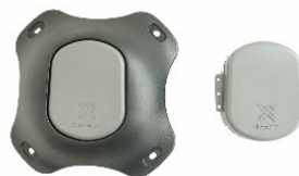
SPS-X surface mount and sub-surface sensors

Real-time data also allows for the addition of wayfinding signage which can direct drivers away from busy thoroughfares with limited parking to areas with higher parking availability. This allows for increased utilization of historically underutilized parking assets, and the reduction of traffic congestion caused by drivers cruising for parking.