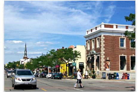
Lakeshore Road in Downtown Oakville

Accessible and stress-free parking is a major priority for most municipalities, and the Town of Oakville wanted to make it a reality for its residents and visitors. With a population of over 200,000 – and growing – the Town knew from previous research that they wanted a reliable sensor-based solution that would provide accurate data monitoring capabilities in order to inform their parking strategy designed to improve driver experience. In particular, the Town wanted to reduce traffic and congestion in their downtown core, with an emphasis on busy downtown thoroughfares like Lakeshore Road. A perceived lack of available parking was causing town residents and visitors to the busy downtown Oakville area to become frustrated with their parking experience.