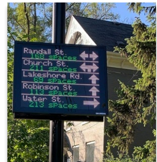
Wayfinding signage in Oakville

After the original installation of sensors and analysis of data, eleven-x worked with the Town of Oakville and a parking payment app provider to add a payment compliance use case. This means the Town could now analyze who is actually paying for parking as well as determine how that number can be increased. The goal here wasn't to increase enforcement of those drivers who hadn't paid for their parking, but rather focus on other ways of increasing payment compliance, including providing more ways to pay or better signage explaining how to pay. Thus, making parking in the downtown Oakville core seamless and easily navigable for drivers.